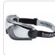
180° panoramic vision