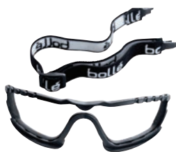
Strap + foam kit Ref. 40043