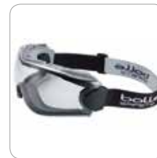
180° panoramic vision