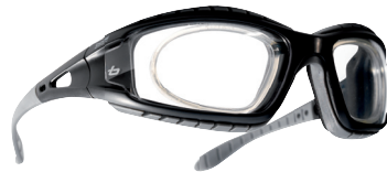
Adaptable on TRACKER II

With such a wealth of experience behind us, and our own purpose, built laboratories with established designers and technicians, our brand range of prescription safety spectacles has been carefully selected to ensure a wide choice of frames with both plastics and metals there's something for everyone, simple ordering and pricing, and our own skilled representatives who will set up your very own prescription service tailored to the specific needs of your company, who better to turn to. We have a wide range of frames that can be glazed with 3 types of prescription lenses (single vision, bifocal, progressive) and 3 different lens materials (polycarbonate, CR39 or toughened glass).