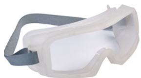
COVACLAVE MADE IN: TW