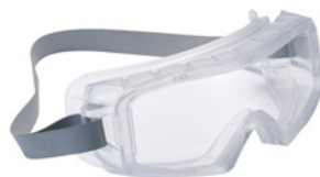
COVACLEAN MADE IN: TW